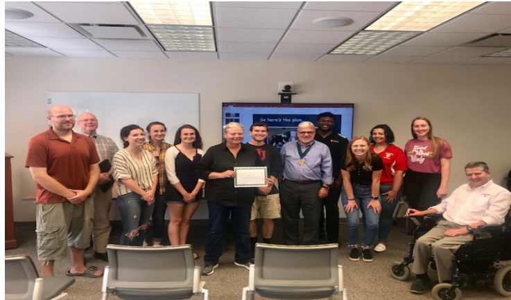
October meeting group picture